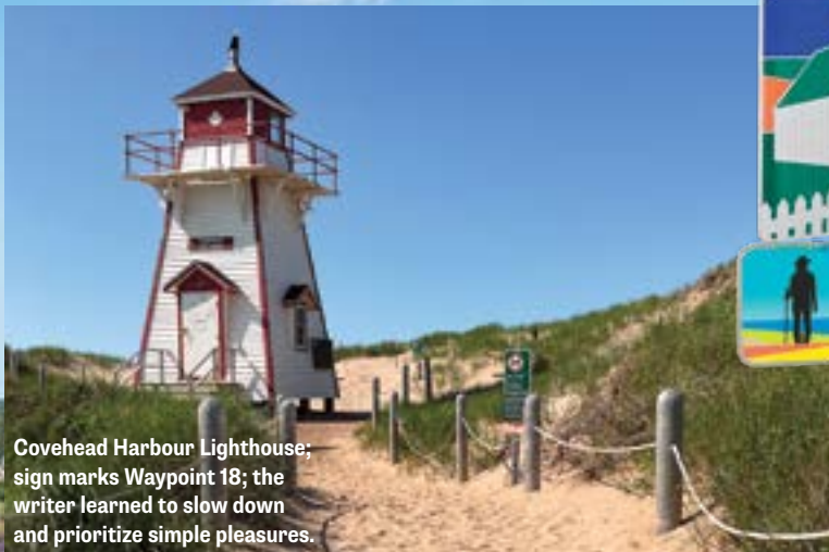
Covehead Harbour Lighthouse; sign marks Waypoint 18; the writer learned to slow down and prioritize simple pleasures.